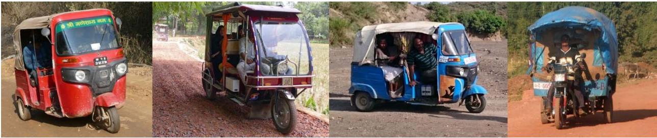
Figure 6 – Examples of rural three-wheelers in Nepal, Bangladesh and Ethiopia (two types)

Three-wheeler public transport is now well established in urban and rural areas in numerous countries in the global south. Three-wheelers are used as point-to-point low-cost taxis or route-based public transport services in Africa, Asia, Latin America (see Figure 7), the Caribbean and the Pacific. They may be powered by petrol (most common), diesel (declining), compressed gas or batteries (increasing).