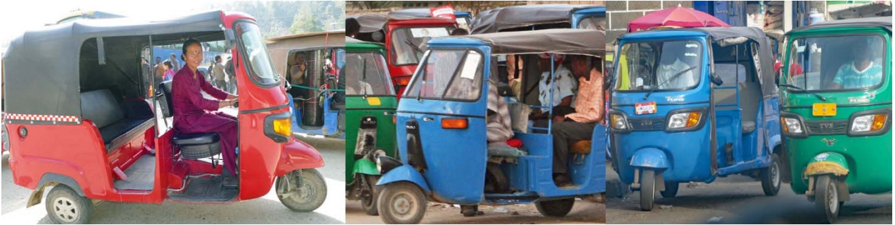
Figure 1 - Examples of 'Bajaj' type urban three-wheelers in Nepal, Tanzania and Liberia

carry six passengers, which was more appropriate for route-based transport services operations. Bajaj soon became the largest manufacture of three-wheelers in the world. By 2018, India was making over one-million three-wheelers a year, of which about one third were exported, including to many African countries [4, 5]. In many Asian countries, three wheelers started to be used as urban transport services, using Bajaj designs, local adaptations and/or local innovations. Examples of Bajaj-type three-wheelers are shown in Figure 1.