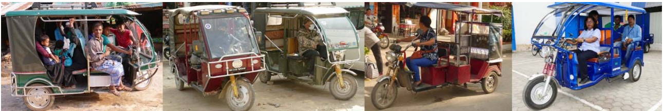
Figure 4 - Examples of electric three-wheelers in Bangladesh, Nepal, China and India

In recent years, China has been promoting the use of electric powered motorcycles, although electric three-wheelers have not spread widely in China, as three-wheelers are not generally permitted as transport services vehicles there. Nevertheless, batteries and electric motors are being exported from China for use in electric three-wheelers. Bangladesh already has large numbers of 'Tom-tom' battery-powered passenger three-wheelers, and smaller numbers are being used in Nepal (see Figure 4). Equivalent vehicles are likely to spread in other countries if such vehicles are seen to have comparative advantages and/or governments intervene through subsidies or prohibition of fossil-fuel three-wheelers.