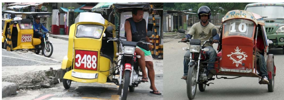
Figure 2 - Examples of side-car public transport three-wheelers in the Philippines and Timor Leste

In the Philippines, some side-car-based passenger three-wheelers were developed, following the widespread use of bicycle-based three-wheel taxis. Similarly, some side-car-based three-wheeler transport services were initiated in Timor Leste (see Figure 2).