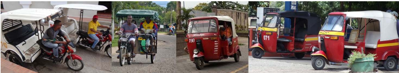
Figure 7 - Examples of three-wheelers in Colombia (two types), Nicaragua and El Salvador

Three-wheeler public transport is now well established in urban and rural areas in numerous countries in the global south. Three-wheelers are used as point-to-point low-cost taxis or route-based public transport services in Africa, Asia, Latin America (see Figure 7), the Caribbean and the Pacific. They may be powered by petrol (most common), diesel (declining), compressed gas or batteries (increasing).