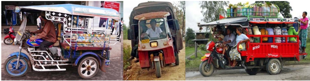
Figure 3 – Motorcycle-based three-wheelers in Lao PDR, China and Myanmar'

In recent years, China has been promoting the use of electric powered motorcycles, although electric three-wheelers have not spread widely in China, as three-wheelers are not generally permitted as transport services vehicles there. Nevertheless, batteries and electric motors are being exported from China for use in electric three-wheelers. Bangladesh already has large numbers of 'Tom-tom' battery-powered passenger three-wheelers, and smaller numbers are being used in Nepal (see Figure 4). Equivalent vehicles are likely to spread in other countries if such vehicles are seen to have comparative advantages and/or governments intervene through subsidies or prohibition of fossil-fuel three-wheelers.