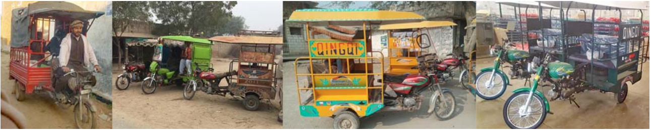
Figure 8 - Examples of Qingqi three-wheelers in Punjab Province, Pakistan

The Plum Qingqi factory initially sold Qingqis with 70 cc or 100 cc motorcycle engines, but now 150 cc or 200 cc engines are more common in Qingqis. This has allowed some workshops to build nine-seater models to allow more passengers to be carried [12]. In addition to the typical six-seater model there are freight versions without fixed passenger seats. There are also some new four-seat versions, manufactured in response to a Supreme Court Judgement on Qingqi specifications [13].