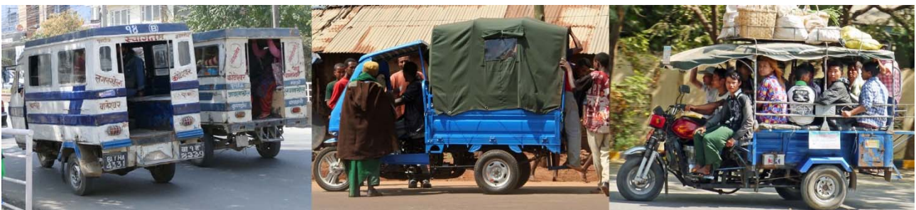
Figure 5 – Route-based three-wheeler public transport in Nepal, Ethiopia and Myanmar

In many low-income cities in Asia and Africa, scooter-based 'auto-rickshaws' or 'Bajajs' provide low-cost taxi services, that tend to be popular with users, but may antagonise car-owners who may see them as badly-behaved and the cause of urban congestion. Some countries have banned them as transport services (eg, China [7] and Ghana [8]), and many countries have limited their operations, prohibiting them from particular roads or areas. Some cities, including Kathmandu and Monrovia have route-based three-wheelers, usually using higher-capacity motorcycle-based vehicles, sometimes with sideward-facing bench seats (see Figure 5).