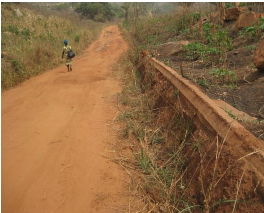
Figure 2: Poor Kerb Drainage Structures Leading to Severe Erosion