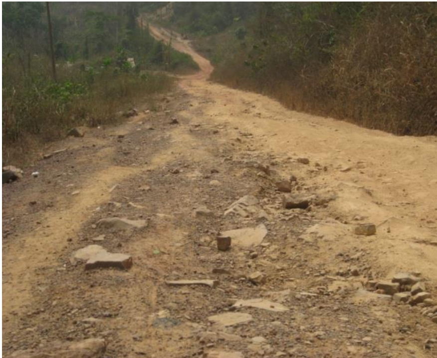
Figure 1: Lack of Roadside Drains Leading to Severe Sheet Erosion

away runoff from the road surface. In some cases, kerbs had been used without success, as shown Figure 2. Where some form of side drain was present, the construction of a low standard and poor workmanship was apparent.