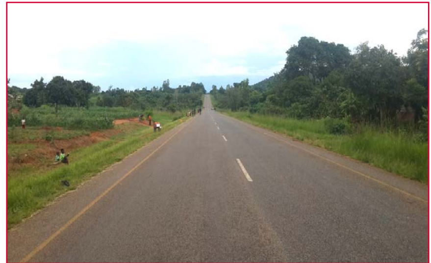
Mchinji - Lilongwe Road Malawi