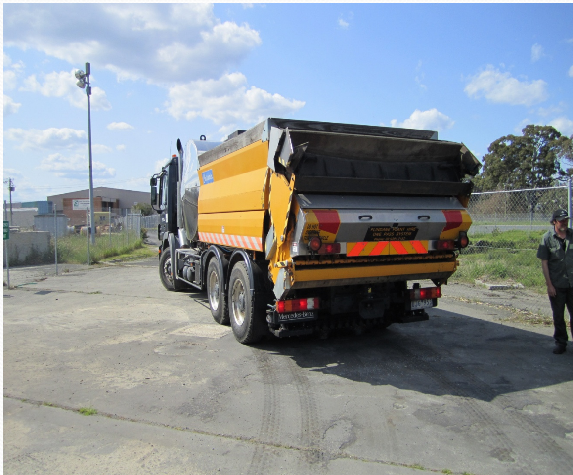
French synchronized spraying / spreading equipment