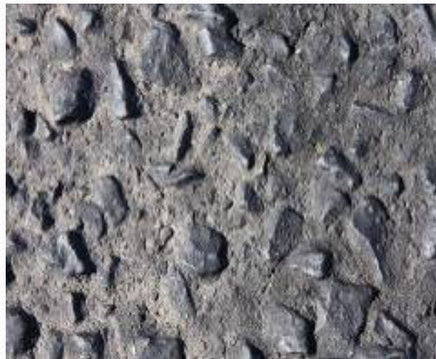
Typical spread of aggregate for a Cape Seal