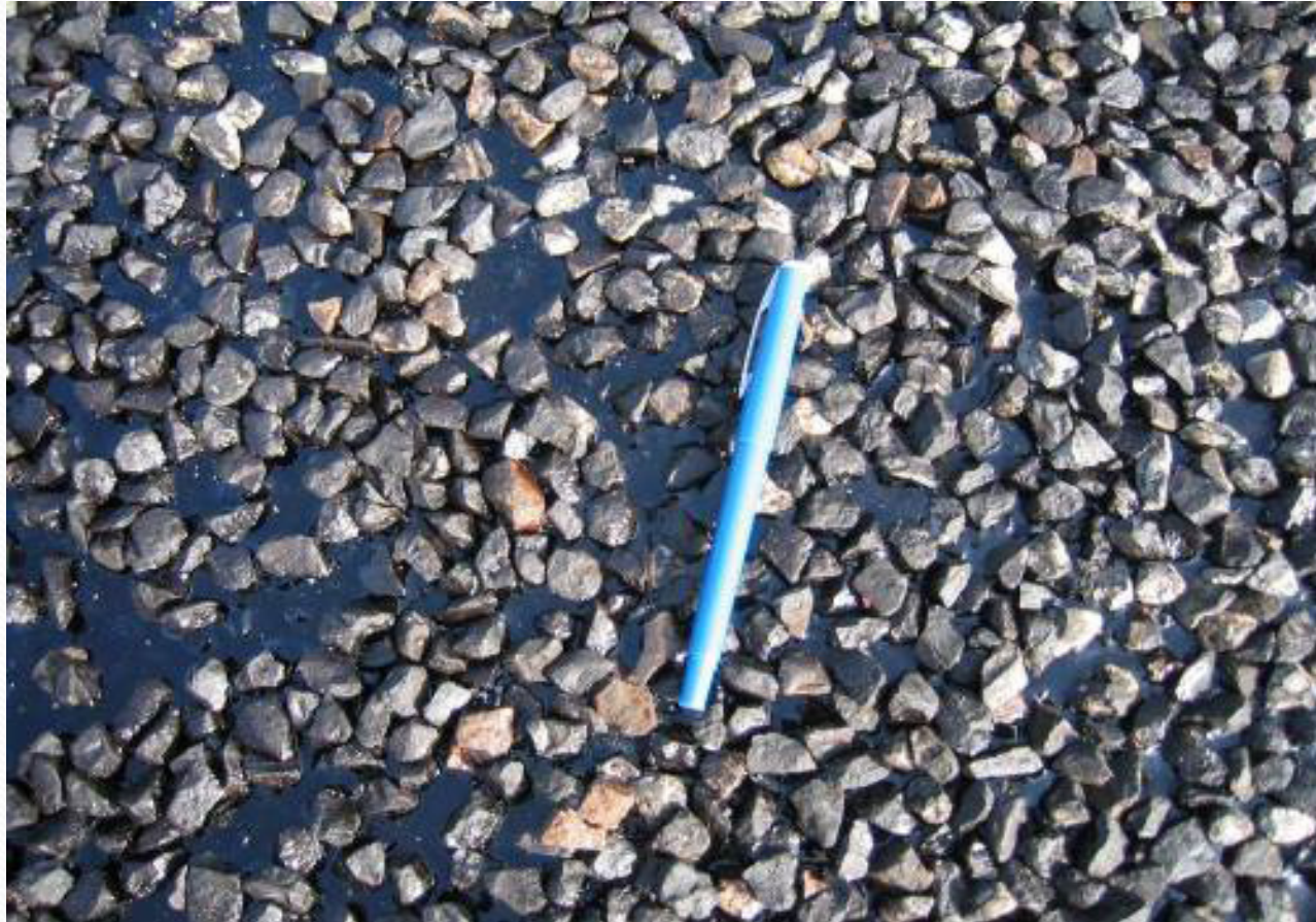
Bitumen filled seal