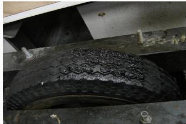
Tyre with bitumen adhered