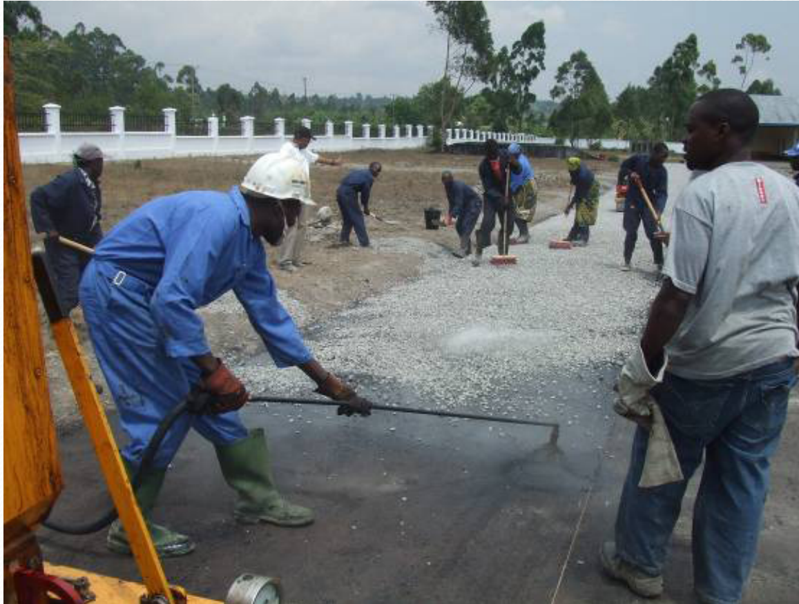
Continuous operation of spraying binder and spreading chippings