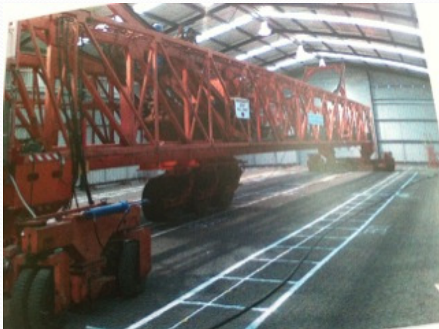
Accelerated Loading Facility (ALF)