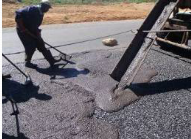
Hand-spreading of slurry