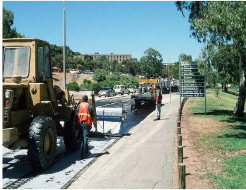
Installation of fabrics