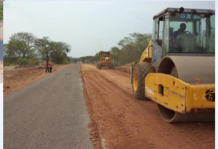
Bottom Road Lot 1