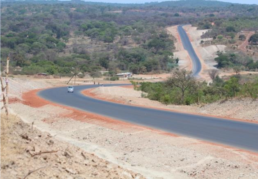
Leopards Hill, State Lodge To Katoba Basic