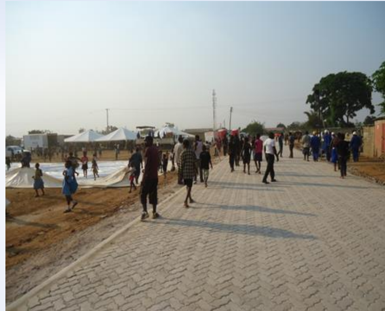
Chawama Township, Lusaka