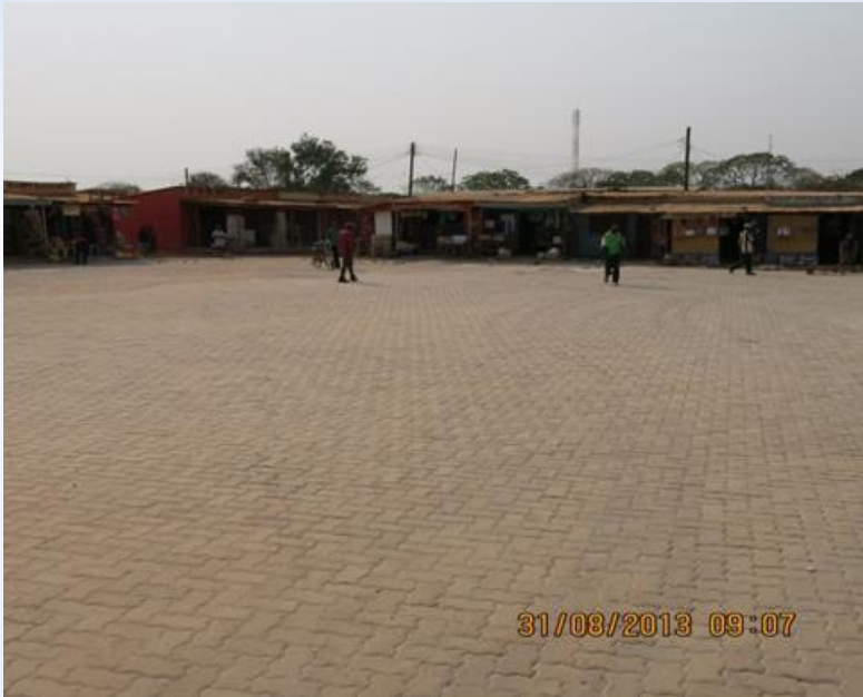
Petauke, Eastern Province