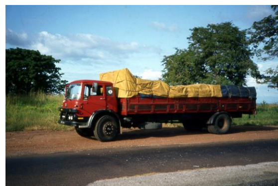
Image 4 – Grossly overloaded truck with main axle springs near physical limits.