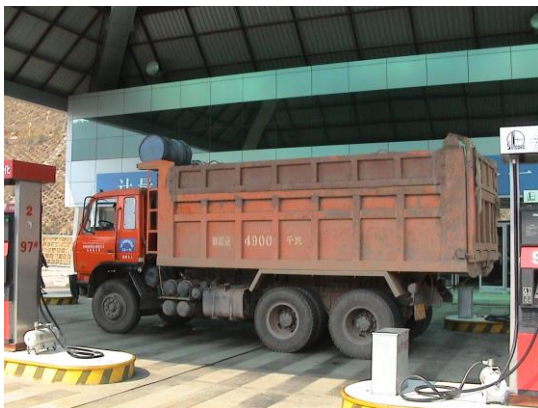
Image 1 – Truck bodies extended in China to increase load capacity

Vehicle design and manufacture is developed completely within the private sector and is driven by the global commercial pressures of vehicle users for increased loads and lower unit costs. The capacity and durability of commercial trucks has increased over the years to meet these demands. Trucks are often modified locally to increase capacity and can operate without undue additional owners' costs at well above vehicle rated design and typical legal road loadings. Trucks used for haulage of primary construction materials, lumber and long distance haulage are particularly susceptible to be grossly overloaded compared to legal load limits. The rapid infrastructure development in the region (particularly China and Vietnam) adds to the pressures for overloading.