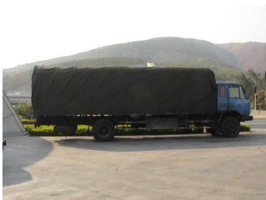
Image 3 – Lax vehicle registration and control can allow very large body capacity and pavement & bridge damaging vehicle configurations.