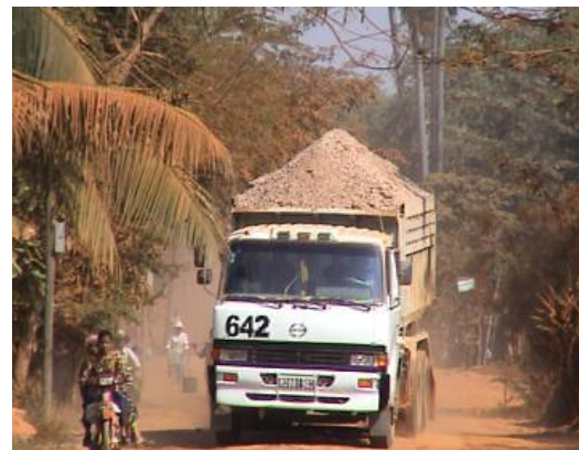
Image 2 – Truck bodies extended in Cambodia to carry at least 20m 3 of construction materials on 3 axles.