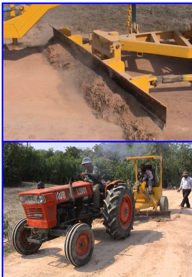
Figure 2 - ENGINEERED NATURAL SURFACES: Maintainable using simple locally made equipment & basic agricultural tractors

Poor people often rely on non-motorised transport, motorcycles and simple trucks for their transport needs. On many soils, an engineered earth road is sufficient to provide reliable basic access for these vehicle types, provided that specific, limited location constraints, such as watercourse