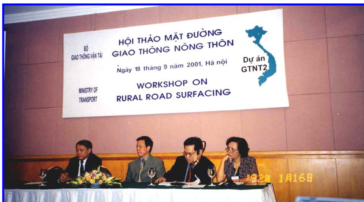
Figure 6 – Initial Rural Road Surfacing Workshop chaired by Vice Minister, October 2001

An important part of the process of bringing about desirable sector changes to allow the use of appropriate rural road surface options and SMEs, is to develop an effective steering framework to plan and manage the introduction of new techniques, procedures and operational framework, with appropriate awareness creation, stakeholder consultation and knowledge dissemination.