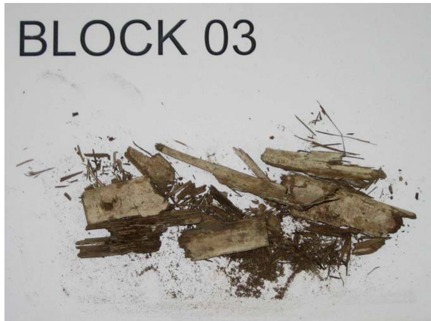
Figure 5.3 The condition of the bamboo after extraction from crushed block (No 3)