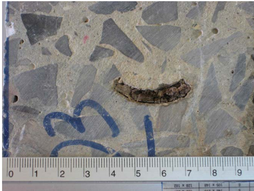
Figure 5.2 The condition of the bamboo after six years within a cut block (No 3)