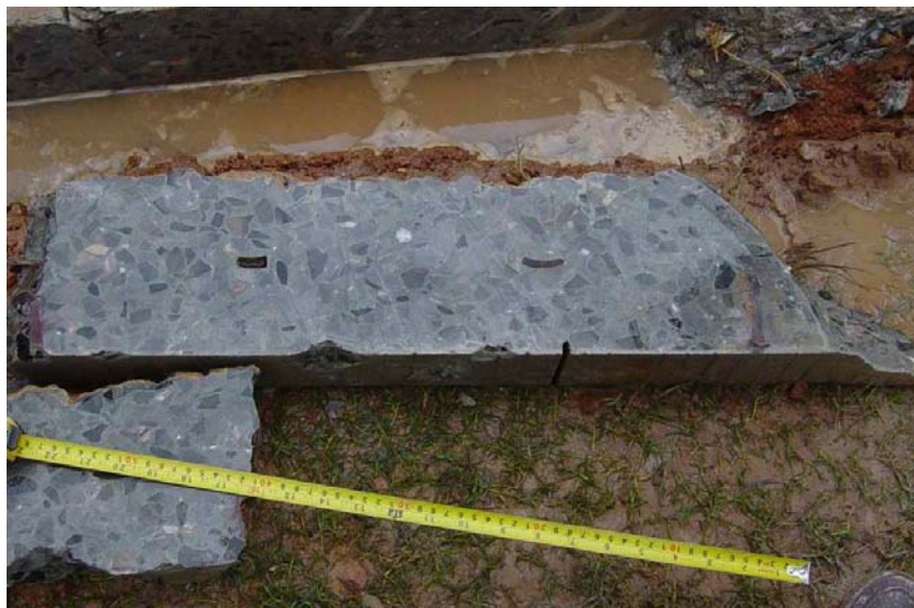
Figure 5.1 Beams cut from the road at Puok showing bamboo

Inspection of the road after six years indicated no serious cracking had occurred. Blocks of the BRC road at Puok market, suitable for strength testing in the laboratory, were cut from the trial road using a pavement saw. Cuts were made in such a way that blocks were extracted with and without bamboo running longitudinally down the centre of the specimen, one of the intentions being to compare the strength of the two to determine the effectiveness of the reinforcement. However, much of the bamboo was found to have disintegrated, as shown in the following photographs.