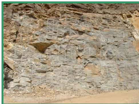
Pictures left: Log barrier and stable slope after controlled blasting

Permanent structures and road foundation and surface layers are now taken up with the formation-cutting works in one contract. This provides an incentive for the contractor to ensure that excavated useful materials like boulders are kept aside and are used as construction materials for the structures and base course. It also ensures that proper water drainage is available right from the first monsoon, to avoid the risk of erosion and landslides.